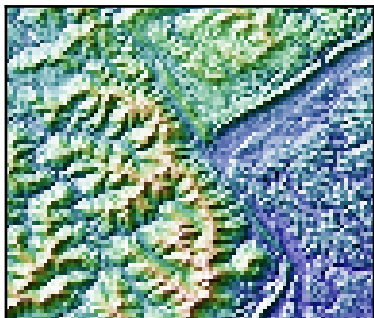
Blend Mode: "hsv" (default)